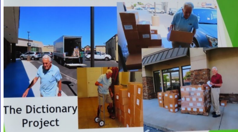
The Dictionary Project